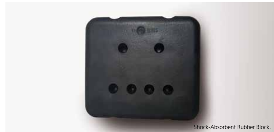
Shock-Absorbent Rubber Block.

companies engaged in refrigerated freight, Corey adds, thanks to its innovative shock-absorbing bearing concept that ensures extra comfort and smooth ride. "The C-bearing mounting has been designed to increase the driving comfort while reducing