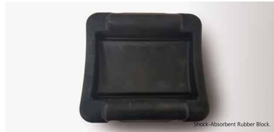
Shock-Absorbent Rubber Block.

Fast Fact The JOST LubeTronic automatic system keeps the JSK 37CW fifth wheels adequately lubricated by electronically dispensing high performance grease, minimising maintenance and eliminating manual greasing.