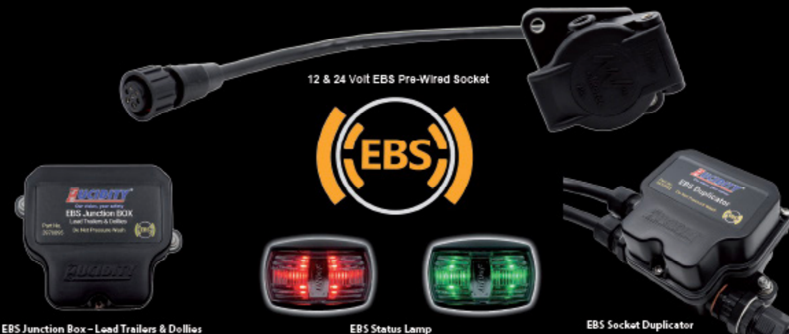
EBS Junction Box – Lead Trailers & Dollies